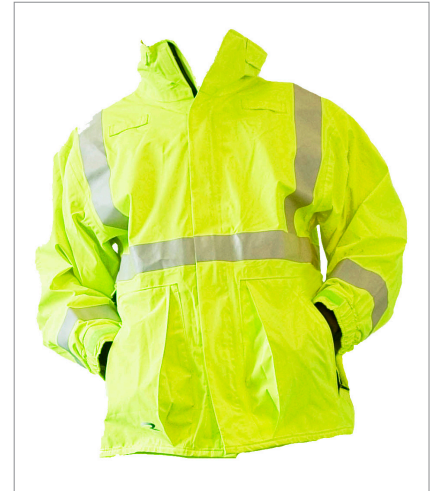
ANSI 107 Certified Lightweight Jacket & Pants