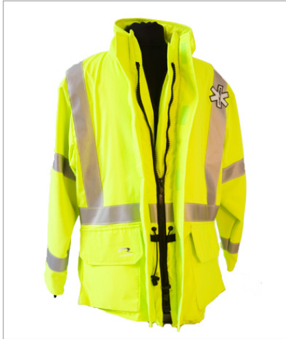
ANSI-107 and NFPA-1999 Certified Jacket & Pants

Ricochet is dedicated to developing products that provide superior safety and comfort for your team. Our ANSI-Certified High-Visibility Series meets several certifications to meet your needs. Visit www.ricochet-gear.com or contact Ricochet at 1.888.462.1999 to learn about all of Ricochet's products.