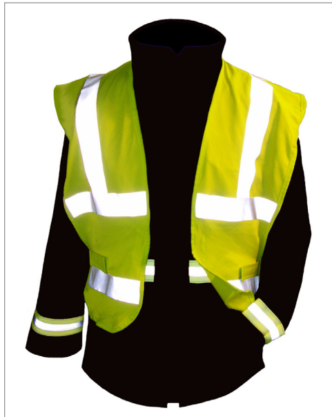
ReadyVIZ™ integrated into an NFPA-1999 certified Ricochet jacket